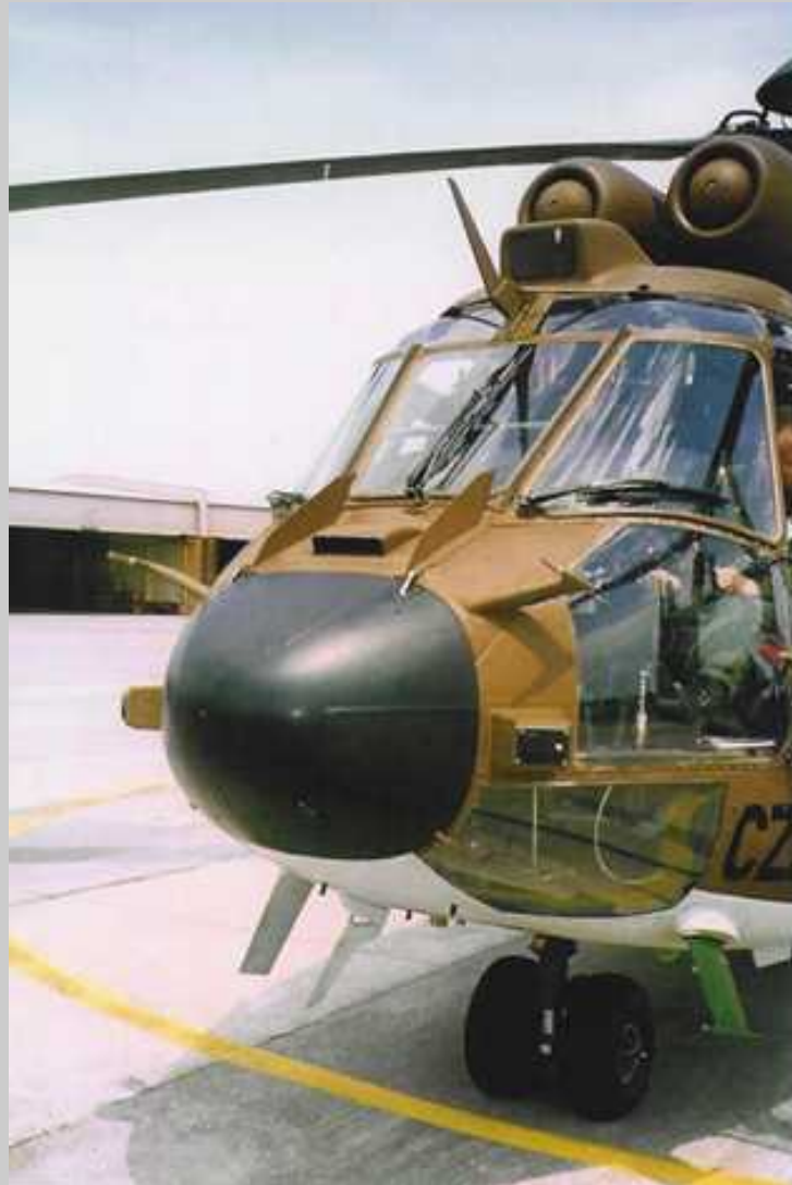
The Fruit RWR systems seen on a Cougar Horizon helicopter

The Horizon squadron, part of the French Army's 1st combat helicopter regiment, is unique. Based in Phalsbourg, northeast France, the unit operates four Cougar helicopters equipped with Horizon radars under the operational command of the Army's intelligence brigade. Horizon is a French heliborne surveillance radar system designed to detect moving targets on and close to the ground. The system traces its origins back to 1986, when an SA-330 Puma was fitted with the Orphée radar under the Orchidée programme (Observatoire Radar Cohérent Héliporté d'Investigation des Éléments Ennemis). The Orchidée system was deployed during Operation Desert Storm in 1991, when it demonstrated the clear benefits of a heliborne MTI (Moving Target Indicator) for airland manoeuvres. It was operated by the French Army's Daguet division, attached to the U.S. Army's 18th Airborne Corps and deployed around the Iraqi town of As Salman in January and February 1991, and served as the French counterpart of the American Joint STARS system. During its twenty-four combat sorties, Orchidée provided target data for AH-64 Apache attack helicopters of the US Army and SEAD missions conducted by the US Navy. Based on this experience, the French Ministry of Defence in October 1992 placed an order for the system, now known as Horizon, to equip a Eurocopter AS-532 Mk2 Cougar.