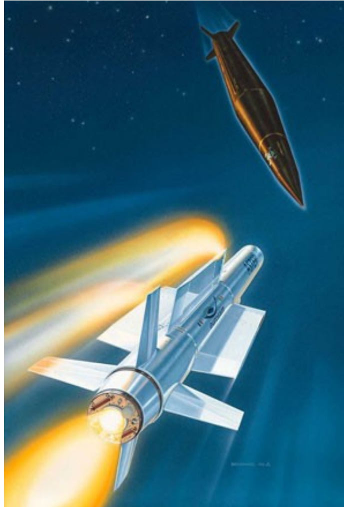
ASTER missile intercepting a Scud

Theatre ballistic missiles are the ideal vehicle for delivering weapons of mass destruction (nuclear, biological, radiological or chemical) over long distances. This threat, which is now a reality, is much more serious than that posed by missiles carrying conventional warheads used in the past. These missiles constitute a global threat, as they can be used both in classic bilateral warfare, as they were during the Iran-Iraq War in the 1980s, and against allied forces deployed in remote theatres of operations, as witnessed during Operation Desert Storm in early 1991. They can also be used to exert political and diplomatic leverage. In this respect, examples include Iraq's use of Scud missiles against Israel during the 1991 Gulf War, China's firing of ballistic missiles into Taiwan's commercial shipping lanes and the North Korean Nodong missile fired into the Sea of Japan. Such actions can prove highly destabilising in the regions concerned.