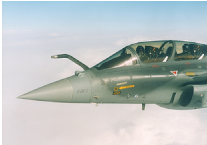
The Rafale's OSF