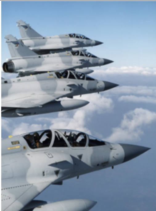
Delivery of the first five Mirage 2000-9 multirole combat two-seaters. The aircraft were ferried to Al Dhafra AB in the UAE from Istres, France on April 26 by their Emirati crews.

Mirage 2000-9 deliveries to the United Arab Emirates Air Force began some months ago. Mirage 2000-9 is the latest evolution of Mirage 2000 family which includes different aircraft versions operated by eight different countries. Mirage 2000-9 is mainly characterised by highly evolved avionics, including a new RDY2 radar, a sophisticated EW suit, IMEWS, and a wide range of modern weapons. Major involved companies are Dassault Aviation, MBDA, SNECMA, Thales and Elettronica. This challenging program was developed on request of MG Khaled bin Abulla Mubarak al Buainain, UAE air force and air defense commander. It was formally launch with global contracts in November 1998, and the first flight of this new version took place in December 2000, at Istres Flight Test Base. Those deliveries concretise a special milestone of this very ambitious program. From now on, the UAE AF has a new outclassing bird in its skies !