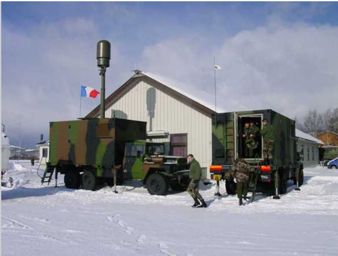
Horizon-world : the ground station linking the Cougar Horizon helicopter's Target MTI radar antenna (above in Phalsbourg AB) seen during a NATO Strong Resolve exercise in Norway in 2002.

Horizon helicopters had participating at Opera joint exercise in October 2003 in France.