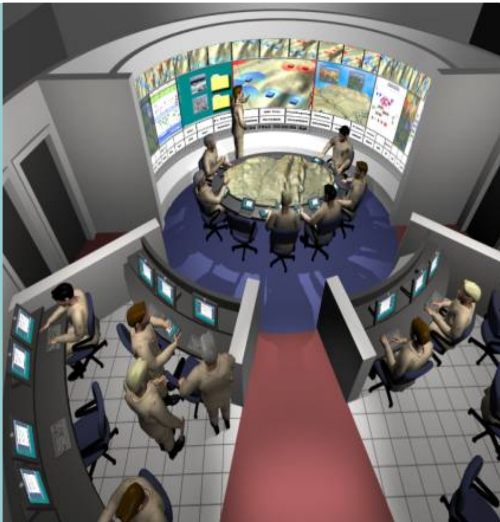
A typical battlelab showing a common operational picture

But how to smoothly inoculate these technologic, operational and above all organizational innovations into our force structure, our command and our doctrine ?