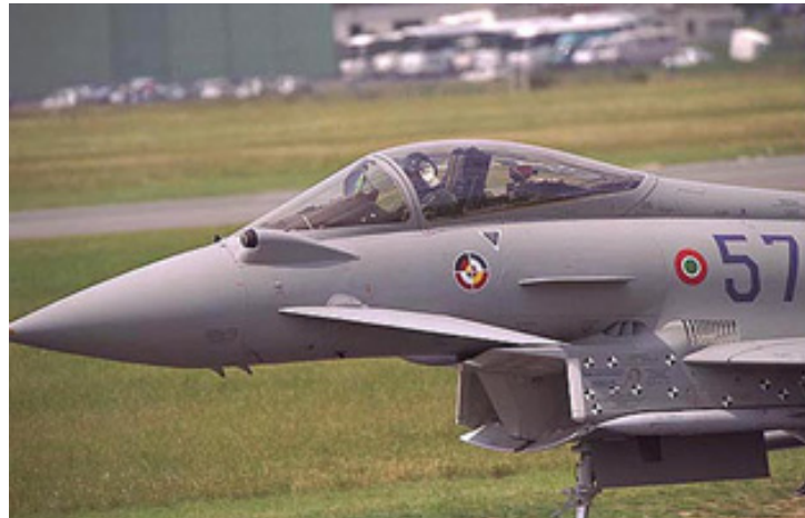
The Eurofighter's Pirate IRST