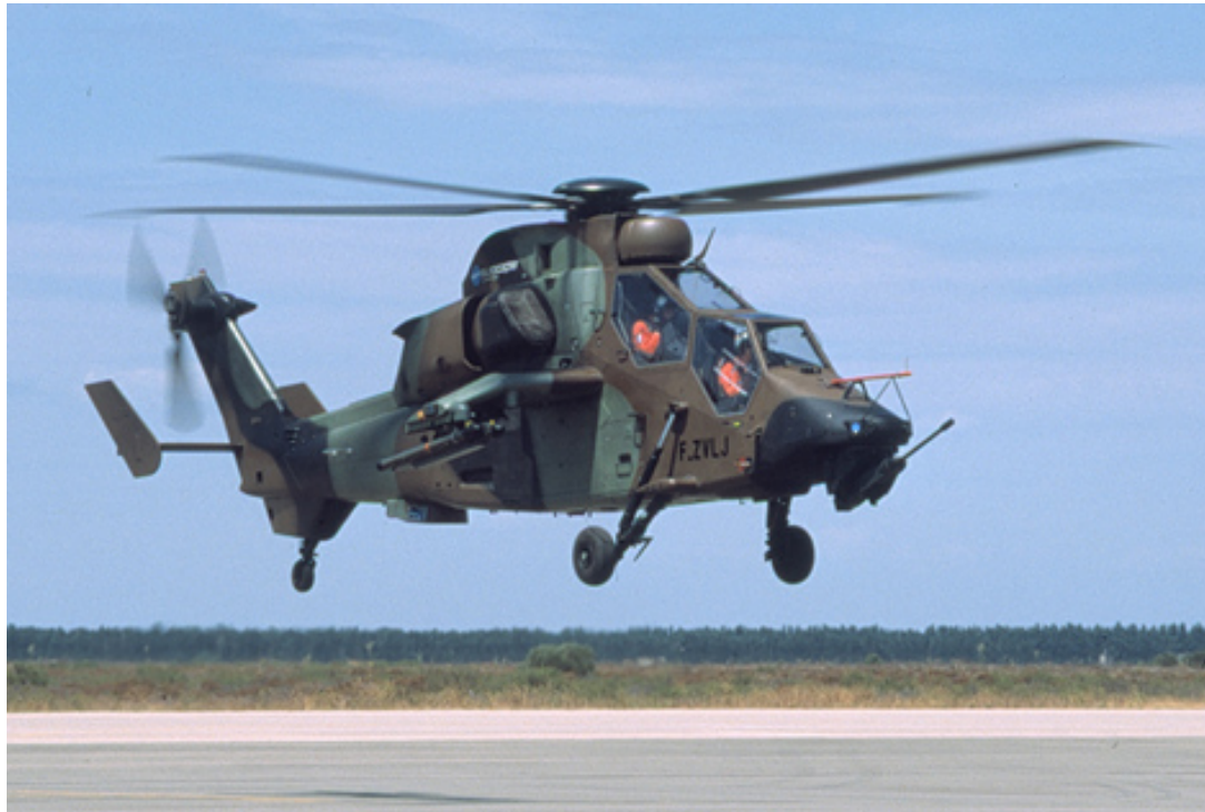
The PS-1 series Tiger shows its complete TWE self-protection system and twin Mistral missiles.

programmability and UAV launching from helicopters.